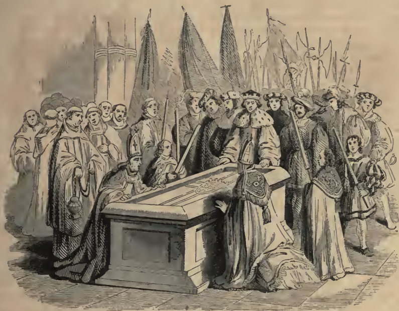
Placing the body in the Tomb.

The archbishop of Rheims celebrated the mass, assisted by the bishops of Paris, Tournay, Cambray and Arras, and likewise by five abbots. There were in the church, during the obsequies, seven hundred candles or thereabouts, and each candle weighed one pound. On the catafalque were five banners : in the centre, the banner of Flanders ; on the right, that of Artois ; on the left, lower down, that of Boulogne ; the fourth of Nevers, and the fifth of Rethel. The catafalque was emblazoned on the right side with the scutcheons of Flanders, and on the left with those of Flanders and Brabant. Down the church were twelve hundred and twenty-six candles, similar to those around the bodies. There was not any lady or damsel present on the part of the duke or duchess of Burgundy except the lady of the governor of Lille.